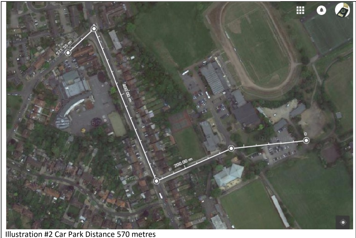
Illustration #2 Car Park Distance 570 metres

450 cars at 5 metre spacing in a queue is 2.25km long