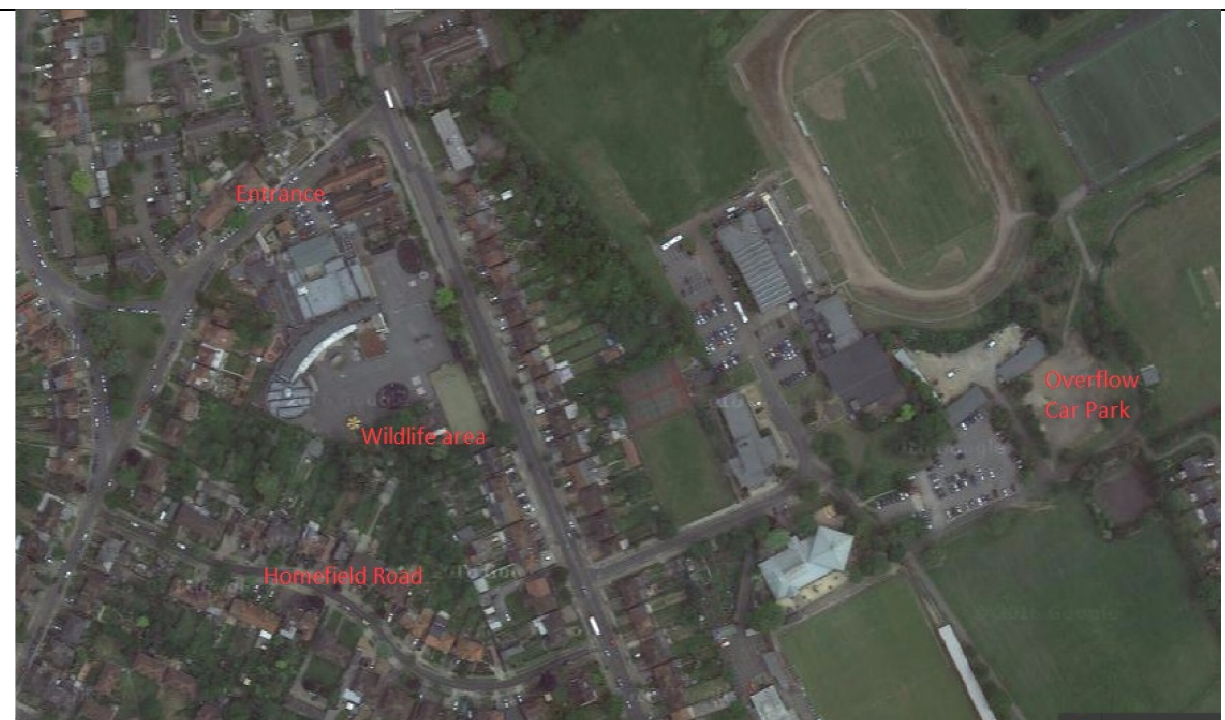
Illustration #1 locations

See illustrations. #1 shows the locations. #2 shows the walking distance is 570 metres.