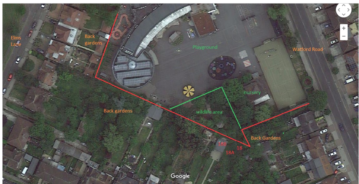
Illustration #3 Wildlife area & proximity to back gardens

See illustration #3 showing the Wildlife Area & proximity of back gardens